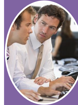
Implementation of Budget Software