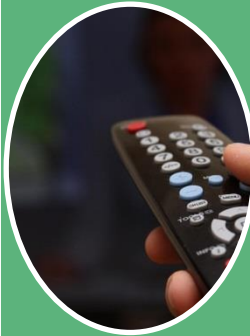
Cable TV Franchise Fees