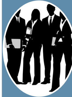
Vacant Position List