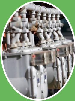
Utility Users Tax Projections