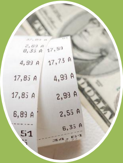
Sales Tax Projections