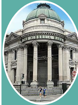
Letter of Credit Impact on Fund Balance